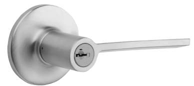
Palmina Entry lever in Satin Chrome