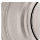
Satin Nickel 15