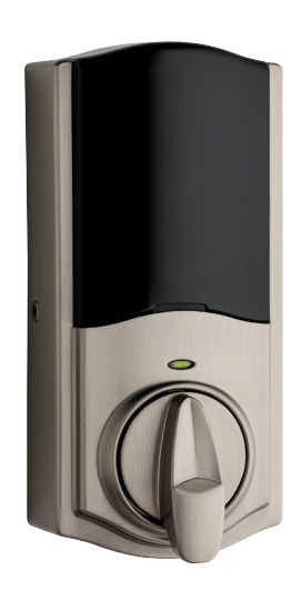
Satin Nickel 15