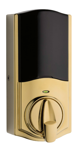
Polished Brass Lo3