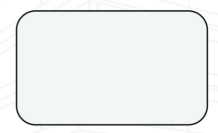
Construction User EV3 Card 4242