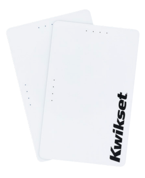
EV3 & Prox Access Card 4210