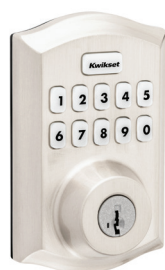
Satin Nickel 15