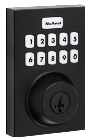
Matte Black 514