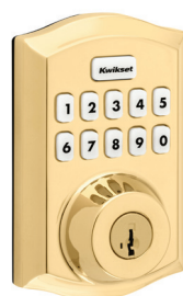
Polished Brass 3