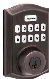
Venetian Bronze 11P