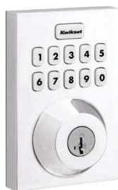
Polished Chrome 26