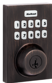
Venetian Bronze 11P