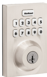
Satin Nickel 15