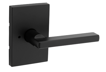
Halifax™ Rectangle Passage Lever in Matte Black