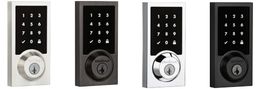
15 Satin Nickel