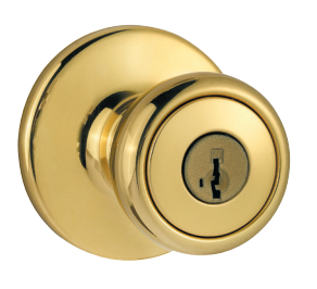
Tylo Entry knob in Polished Brass