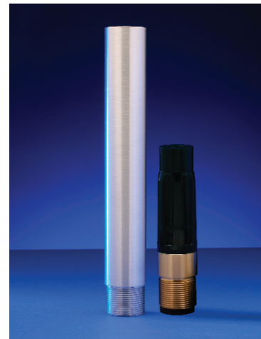
SN159-6XL vs. TLVE-6P

Microstructure of BP200 Elongated grains provide increased toughness over competitive lightweight ceramic nozzles