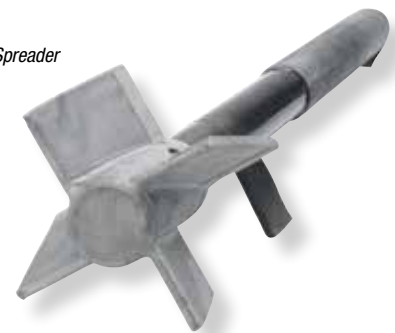
Low Swirl Coal Spreader

Wisconsin Electric tripled the service life of their Controlled Combustion Venturi® burner components with Kennametal.