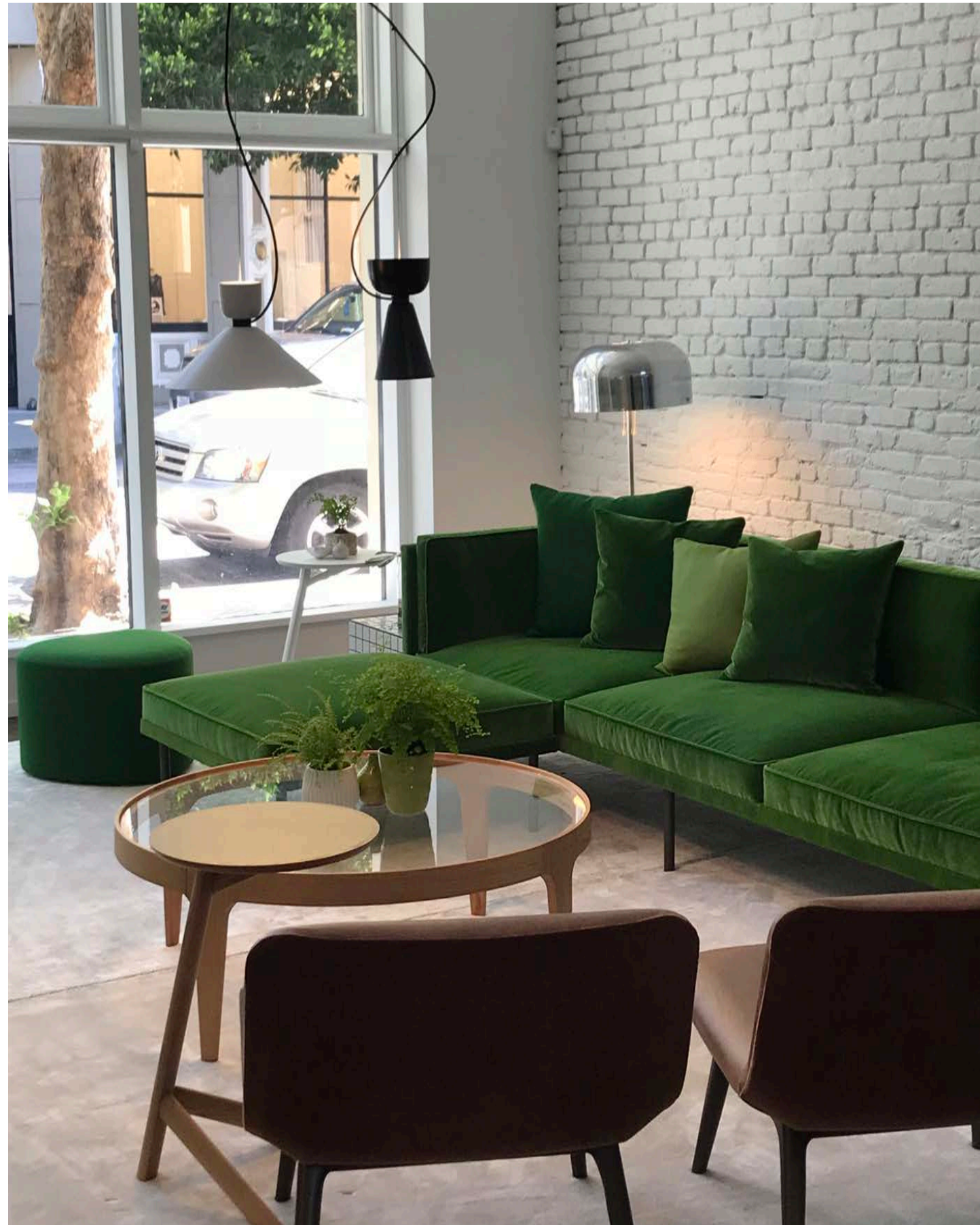
MOD Sofa + Ottoman