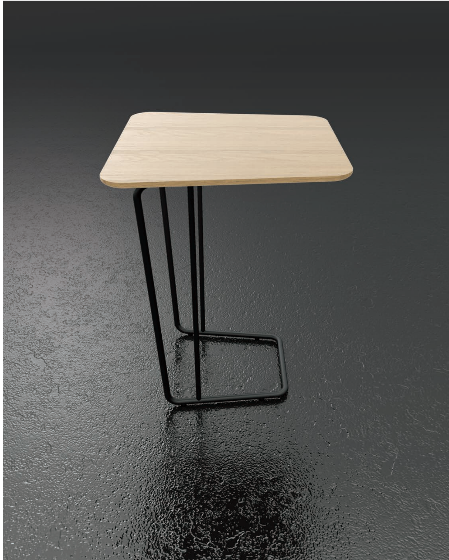
Link Satellite Table