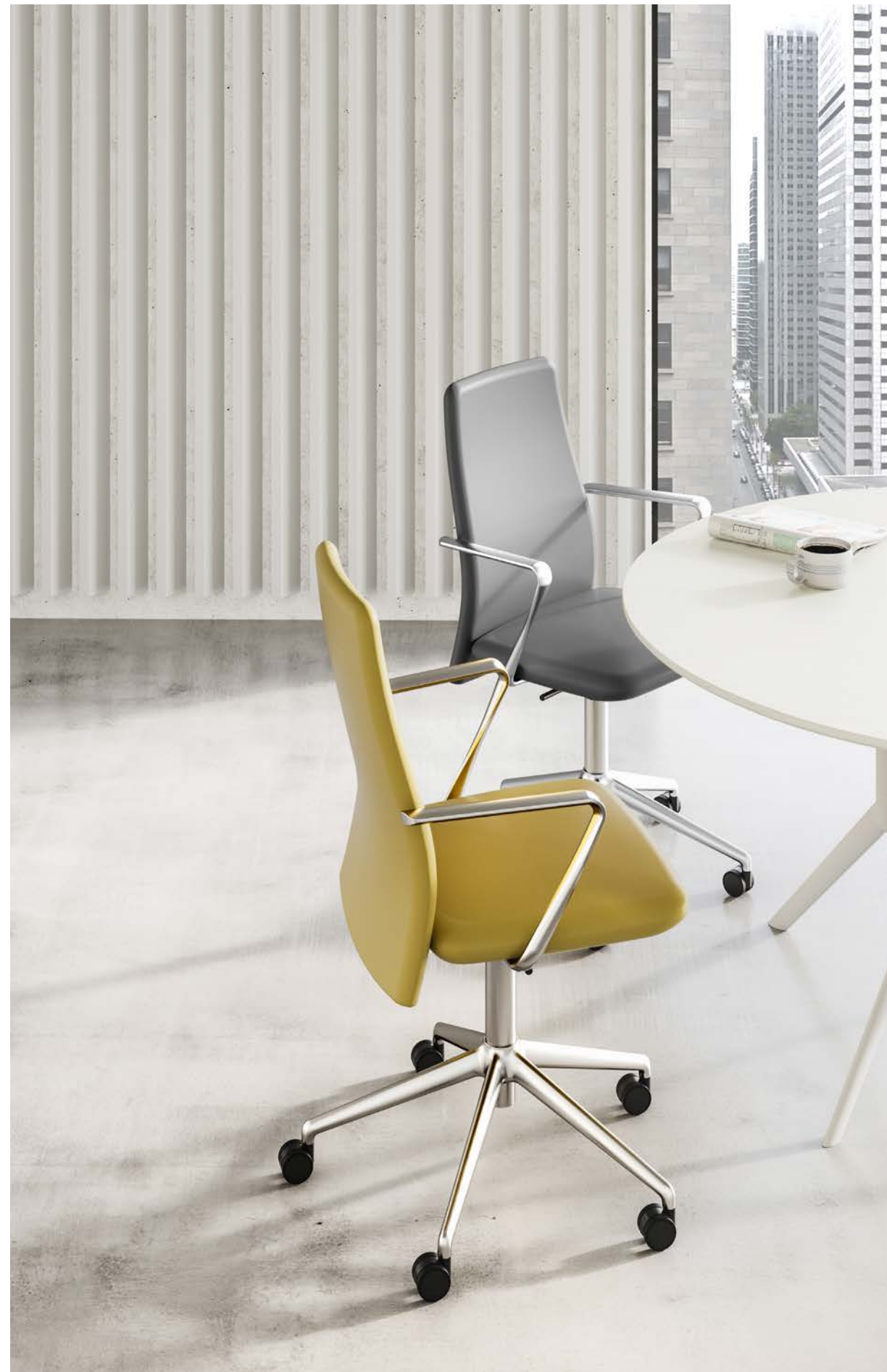
Vela Swivel Tilt