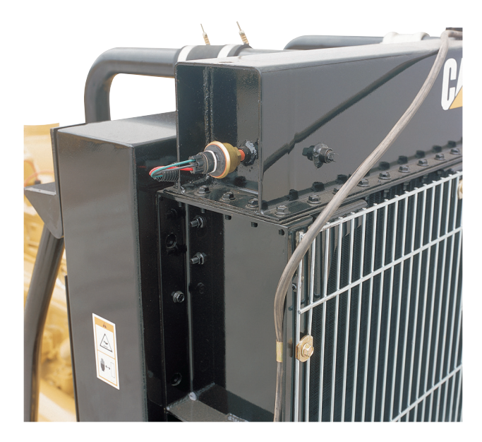
Figure 8: Coolant Level Sensor in a Cat® G3406 Engine

Cooling system pressure is also important. A leaking pressurecontrol cap will lower the coolant boiling point, allowing