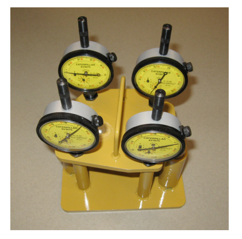
Figure 6: New Valve Recession Measurement Tool for Cat<sup>®</sup> G3500C/E Engines

Besides trending wear, valve stem projection measurement can indicate impending engine trouble. Valve stem projection normally will increase as the valve wears into the valve seat over time. A loss of stem projection signals a buildup on the valve face that could hold the valve open and cause valve burning. For example, prolonged light-load operation increases oil consumption and may lead to valve coking.