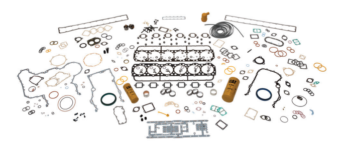
Figure 9: G3406 Complete Foundational Overhaul Kit

For top-end overhauls, remanufactured cylinder heads can be a cost-effective alternative to new components. In this arrangement, the engine manufacturer or a dealer supplies heads rebuilt with a combination of new and/or remanufactured parts that meet the original equipment specifications and carry the same warranty as new. The engine owner then receives credit for the replaced heads and components.