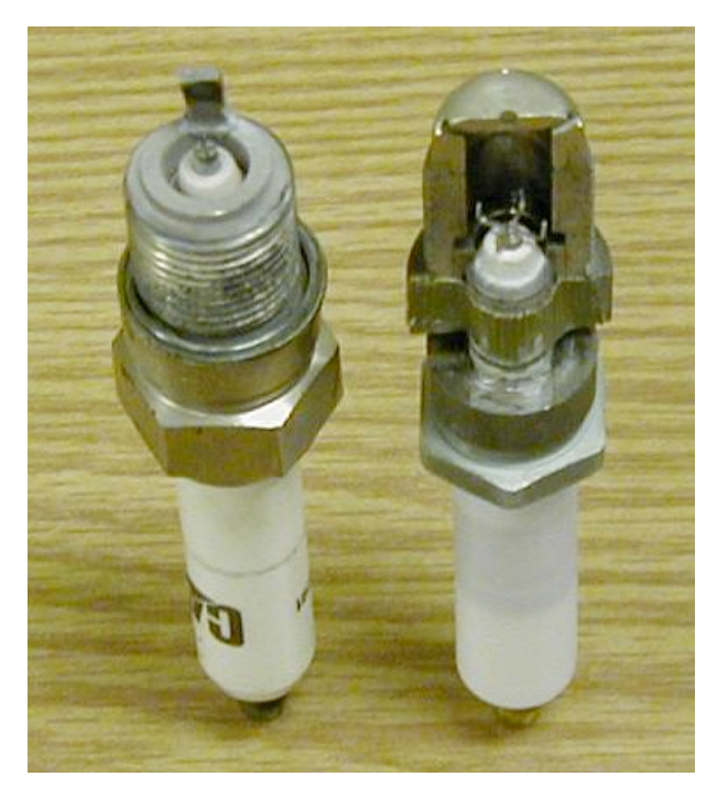
Figure 4: J-Gap (left) Versus Prechamber (right) Spark Plugs

Properly performing spark plugs are critical to gas engine performance, fuel economy and emissions. Today's advanced lean-burn engines may use traditional J-gap spark plugs or prechamber plugs. In the prechamber design, the spark plug admits air and fuel to a small chamber around the electrode by way of small orifices. Upon ignition, the prechamber protects the flame from being "blown out" by turbulence in the cylinder. The growing flame is then ejected through the orifices to ignite the full cylinder's air-fuel charge.