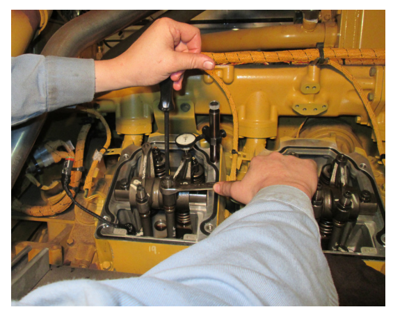
Figure 7: Valve Lash Adjustment

Buildup on the valve face also changes valve lash and therefore valve timing, in turn affecting airflow and the air/fuel ratio in the cylinder. An incorrect valve open/close sequence may cause loss of compression, a richer fuel mixture leading to detonation, or excessive inert exhaust gases in the cylinder at ignition, reducing power output.