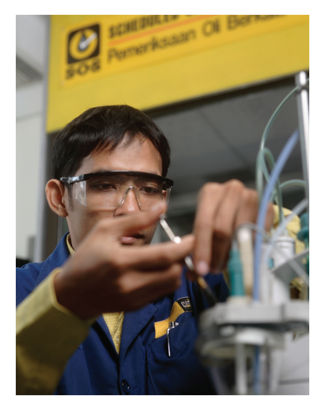
Figure 3: Oil Lab

Used oil then should be analyzed every 250 operating hours up until the first oil change to establish the parameter that will set the condemning limit and to identify the trend for the specific oil formulation. Technicians should take samples while the oil is warm and well mixed to ensure that the sample truly represents the condition of oil in the crankcase.