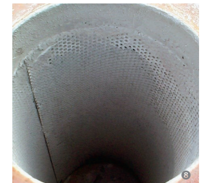
Inside of a muffler with Siloxane residue