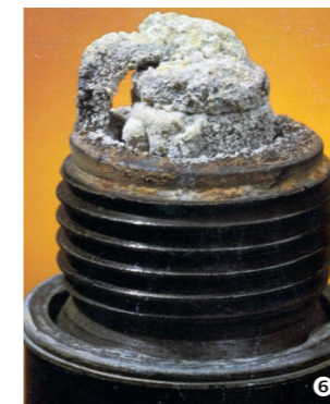
Spark plug contaminated with Siloxanes