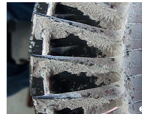
Siloxane build up on Turbocharger turbine wheel