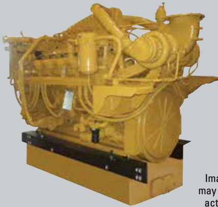
Image shown may not reflect actual engine