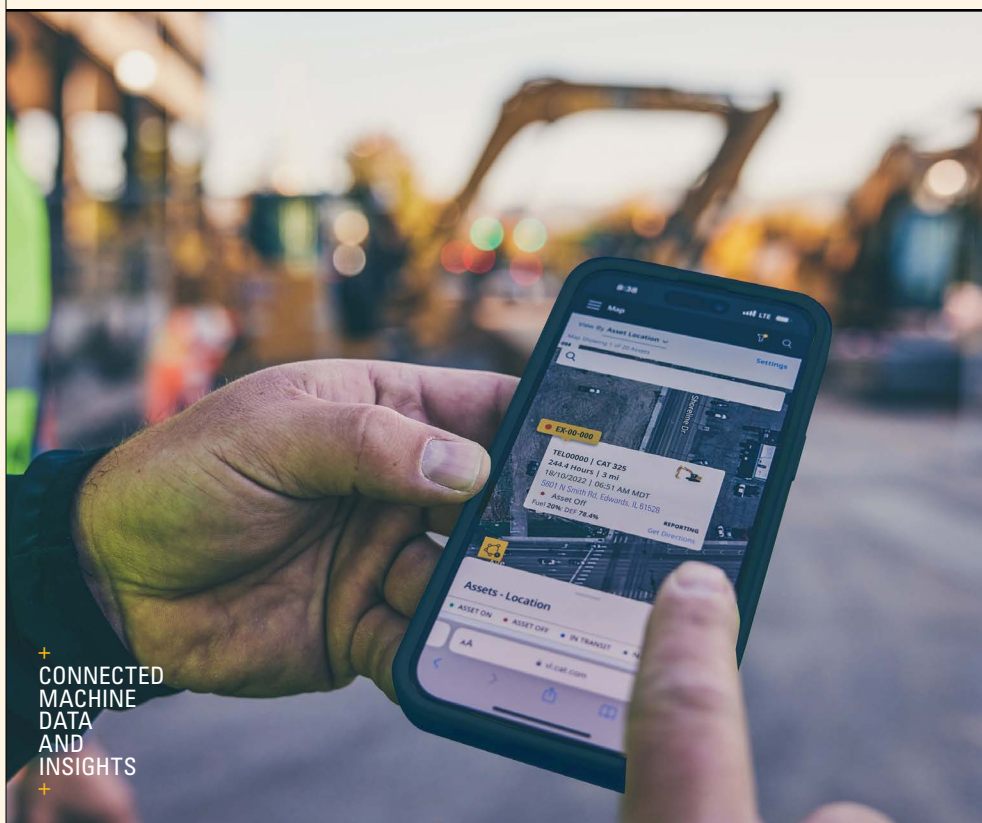
CONNECTED MACHINE DATA AND INSIGHTS

The result — less coordination, fewer disruptions and the confidence that maintenance is done right every time .