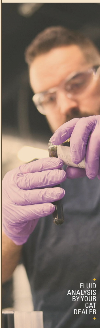
FLUID ANALYSIS BY YOUR CAT DEALER

The goal is simple: turn ownership into a more predictable operating cost, plan service and repairs more effectively and protect your investment over the full life of the machine. For high-utilisation fleets and long-term owners, Confidence delivers exactly what the name states.