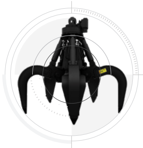
GSV – ORANGE PEEL GRAPPLES