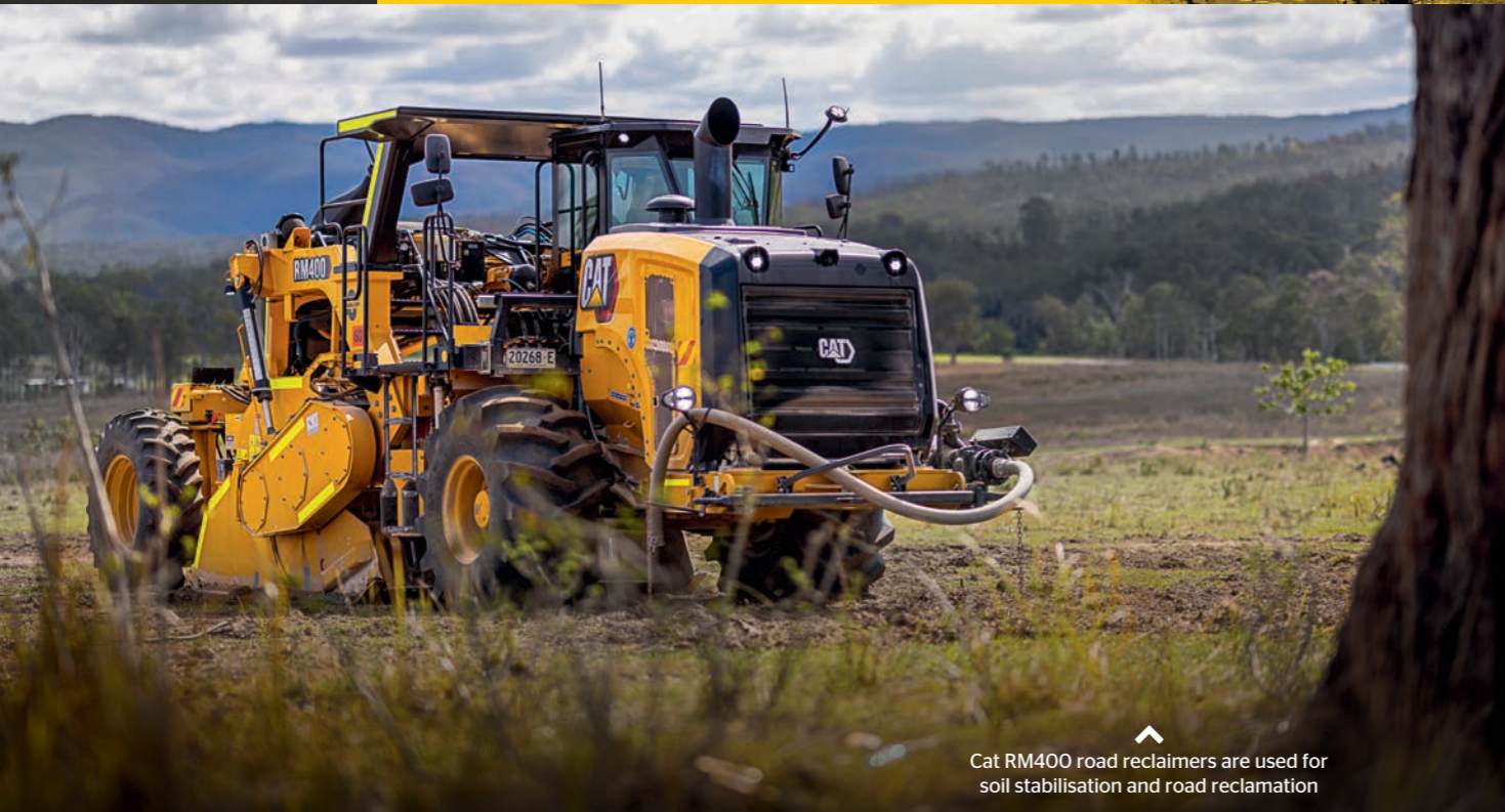
^ Cat RM400 road reclaimers are used for soil stabilisation and road reclamation

getting better and better. WesTrac are definitely industry leaders.”