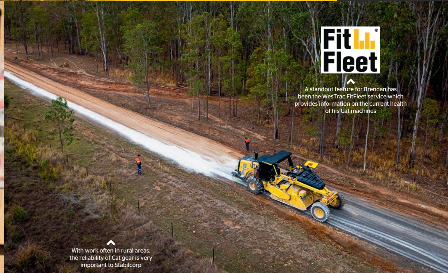
With work often in rural areas, the reliability of Cat gear is very important to Stabilcorp