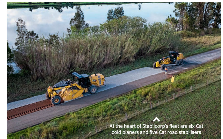
At the heart of Stabilcorp's fleet are six Cat cold planers and five Cat road stabilisers

The planer also has the Cat Grade and Slope system with sensors that