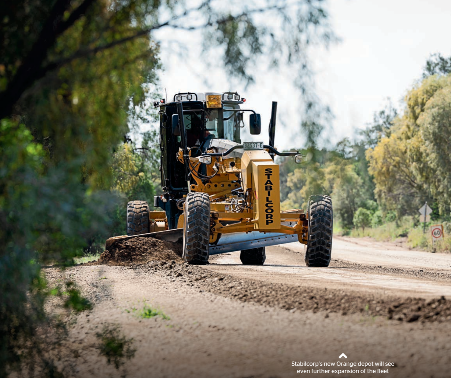
Stabilcorp's new Orange depot will see even further expansion of the fleet

control elevation and slope to ensure a smooth surface, while machinery data is accessible remotely via VisionLink® to assist with fleet management.