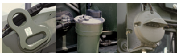
MIL-STD-209K lift and tie downs.