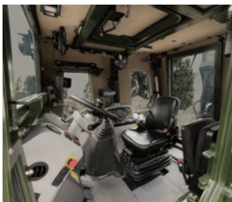
Ergonomic operator station with egress hatch in roof.