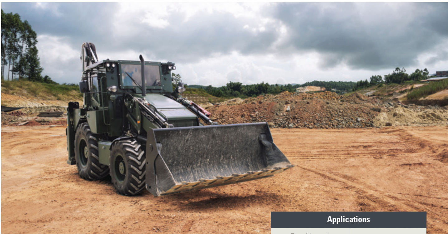
Reduced cab height for C-130 air transportability.