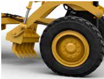
MID MOUNT SCARIFIER