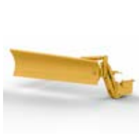
MASTLESS SNOW WING