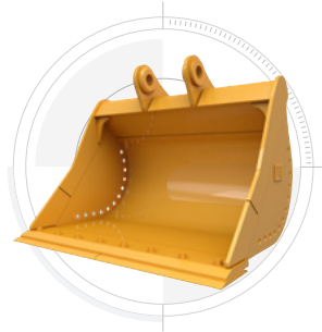
DITCH CLEANING BUCKETS