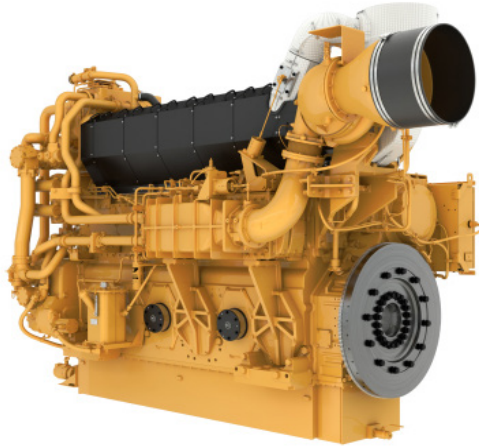
Shown with optional equipment.