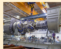
Industrial Gas Turbines