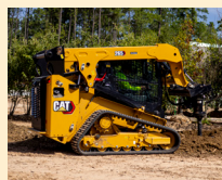
Construction & Mining Equipment

Caterpillar Inc. is the world's leading manufacturer of: