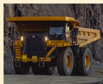
Construction & Mining Equipment