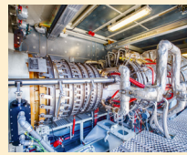
Industrial Gas Turbines