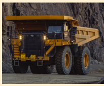
Construction & Mining Equipment