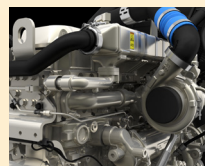
Off-highway Diesel & Natural Gas Engines