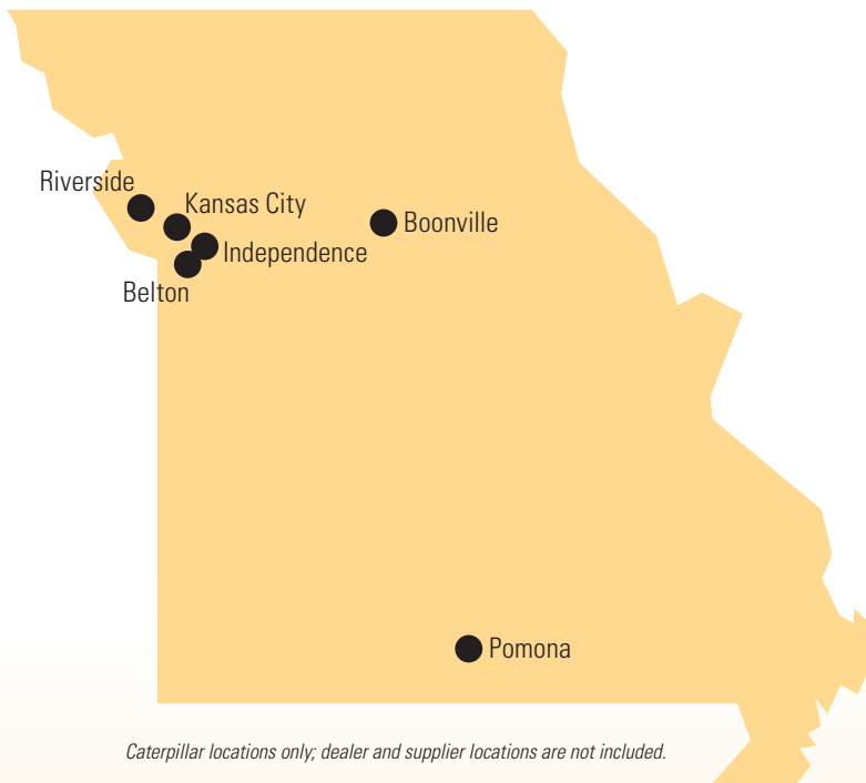
Caterpillar locations only; dealer and supplier locations are not included.