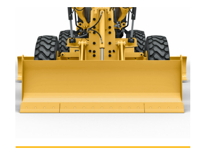
MID MOUNT SCARIFIER