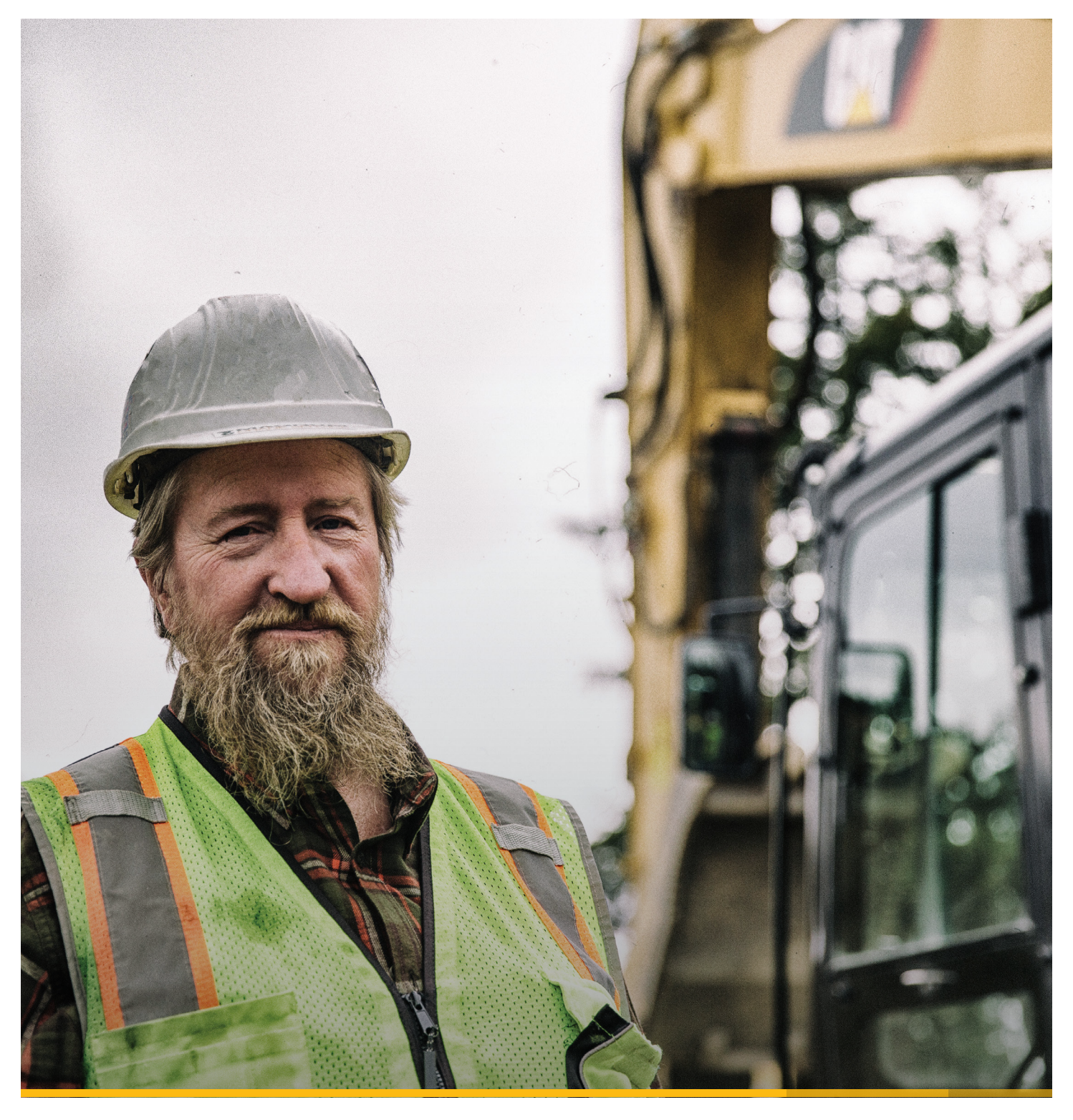
Subject to \ restrictions \ and \ availability. \ Additional \ terms \ and \ conditions \ may \ apply. \ Contact \ your \ Cat \ dealer \ for \ more \ information.

Confidence is the third CVA option when buying a new machine. This option provides the highest level of machine protection and dealer service involvement. See page 11 for the details on what you get with Confidence and how it keeps your machines easy to own and hassle-free.