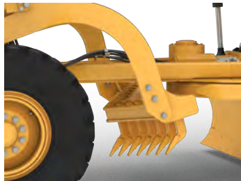
MID MOUNT SCARIFIER