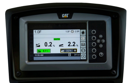
Liquid Crystal Display