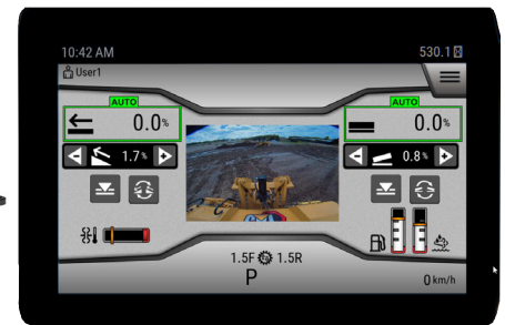
Next Gen Operator Interface