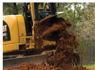
Auger and Auger Bits: Skid Steer Loaders, Compact Wheel Loaders, Mini Excavators and Backhoe Loaders