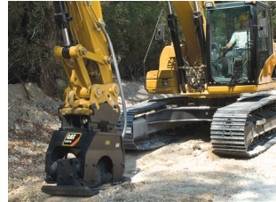
Compactor Plates: Backhoe Loaders, Excavators, Mini Excavators and Wheeled Excavators