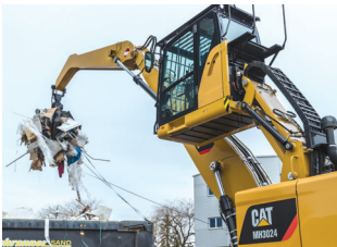
Orange Peel Grapples: Excavators, Wheeled Excavators and Material Handlers