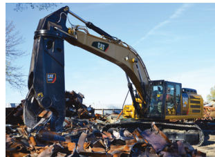
Scrap Shears: Compact Track Loaders, Multi-Terrain loaders, Excavators, Skid Steer Loaders, Wheeled Excavators, Mini Excavators and Material Handlers