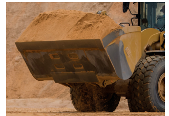
Wheel Loader Buckets: Wheel Loaders, Compact Wheel Loader, Small Wheel Loader and Backhoe Loader