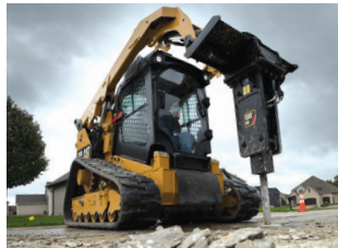
Hammers: Skid Steer Loaders, Mini Excavators, Excavators, Wheeled Excavators and Backhoe Loaders