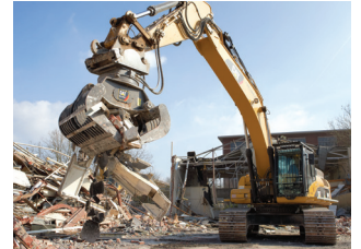
Demolition & Sorting Grapples: Excavators, Wheeled Excavators, Mini Excavators and Material Handlers