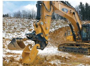
Hex CW Couplers: Material Handlers, Excavators, 5 up to 100 ton