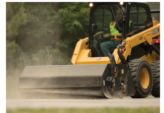
Brooms and Accessories: Skid Steer Loaders, Compact Wheel Loaders, Small Wheel Loaders and Backhoe Loaders