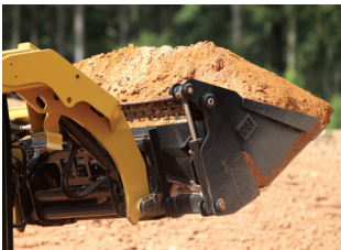
Buckets: Skid Steer Loaders, Compact Wheel Loaders, Small Wheel Loaders, Backhoe Loaders and Telehandlers