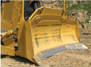
Blades: Compact Track Loaders, Multi-Terrain loaders, Dozers and Motorgraders

That's an unbeatable combination. Even our tools are characterized by their high resale value.