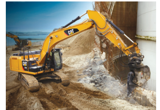
Multi-Processors: Excavators and Wheeled Excavators