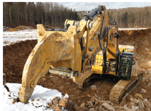
Rippers: Excavators, Mini Excavators and Backhoe Loaders