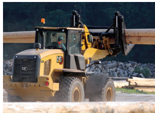
Forks: Skid Steer Loaders, Compact Wheel Loaders, Small Wheel Loaders, Backhoe Loaders and Telehandlers