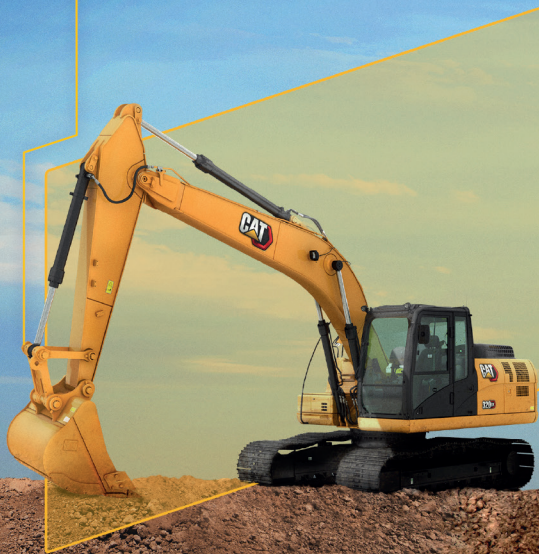
CAT 320 GX