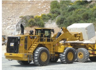
Block-Handling Work Tools: Wheel Loaders