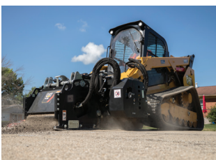
Cold Planers and Wheelsaws: Skid Steer Loaders, Compact Wheel Loaders, Mini Excavators and Backhoe Loaders