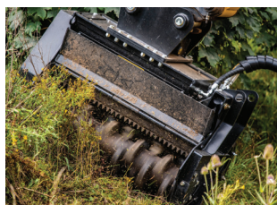
Mulch and Brush Cutters: Skid Steer Loaders, Compact Wheel Loaders and Mini Excavators