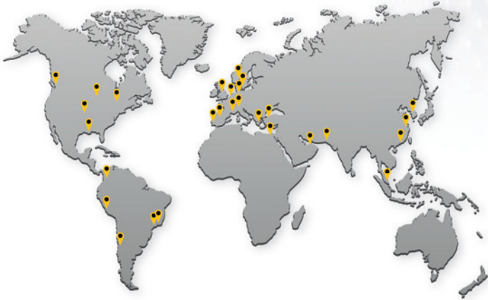
Global dealer network

https://www.cat.com/en_US/by-industry/marine/mak-dealer-locator.html