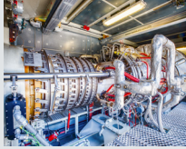
Industrial Gas Turbines