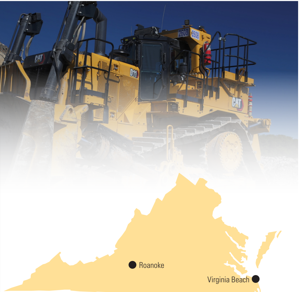
Caterpillar locations only; dealer and supplier locations are not included.