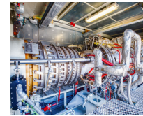
Industrial Gas Turbines