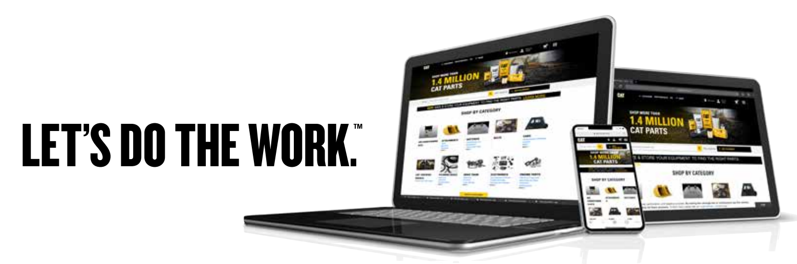
To buy Cat parts online, visit Parts.cat.com.