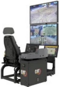
CAT COMMAND STATION