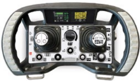
CAT COMMAND CONSOLE