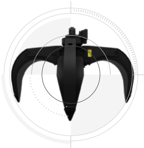
GSV – ORANGE PEEL GRAPPLES