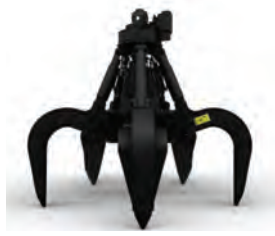
GSV – ORANGE PEEL GRAPPLES