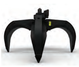
GSH – ORANGE PEEL GRAPPLES

Match your machine to the job. The MH3026 offers four boom and stick combinations. The boom and stick options as well as two undercarriage configurations allow you to customize your machine to meet the demands of your application.