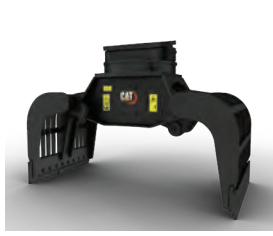
DEMO AND SORTING GRAPPLES