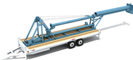
Trailer igniter system