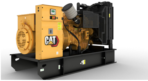
Image shown might not reflect actual configuration