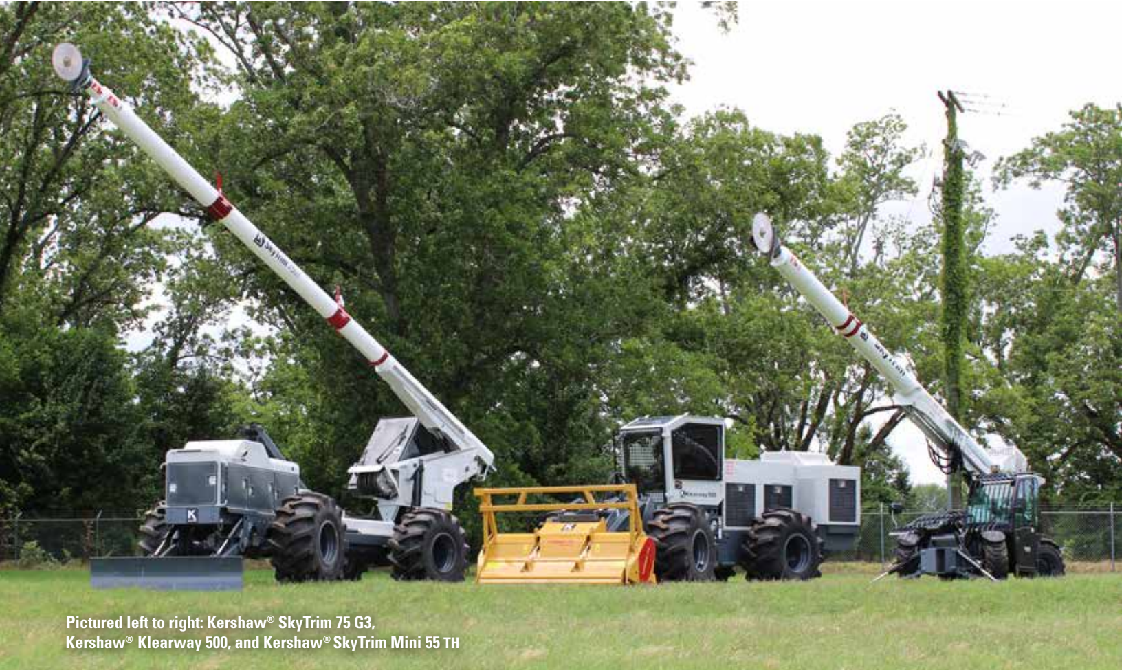
Pictured left to right: Kershaw® SkyTrim 75 G3, Kershaw® Klearway 500, and Kershaw® SkyTrim Mini 55 TH