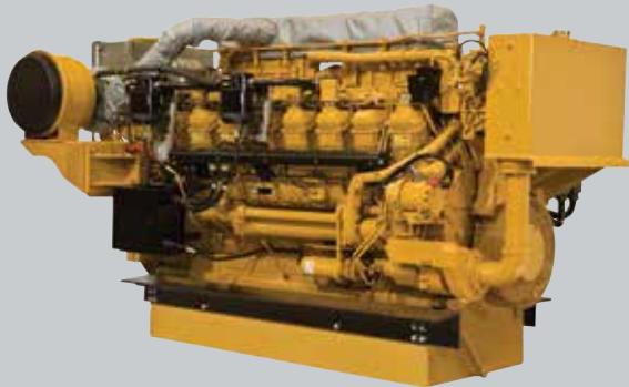
Image shown may not reflect actual engine