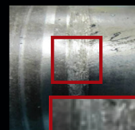
Pin galled from using industry standard grease

Pictures show actual results from a Cat 329 HEX pin & bushing test. Cat grease and a leading competitor's grease ran side by side for the duration of the test.