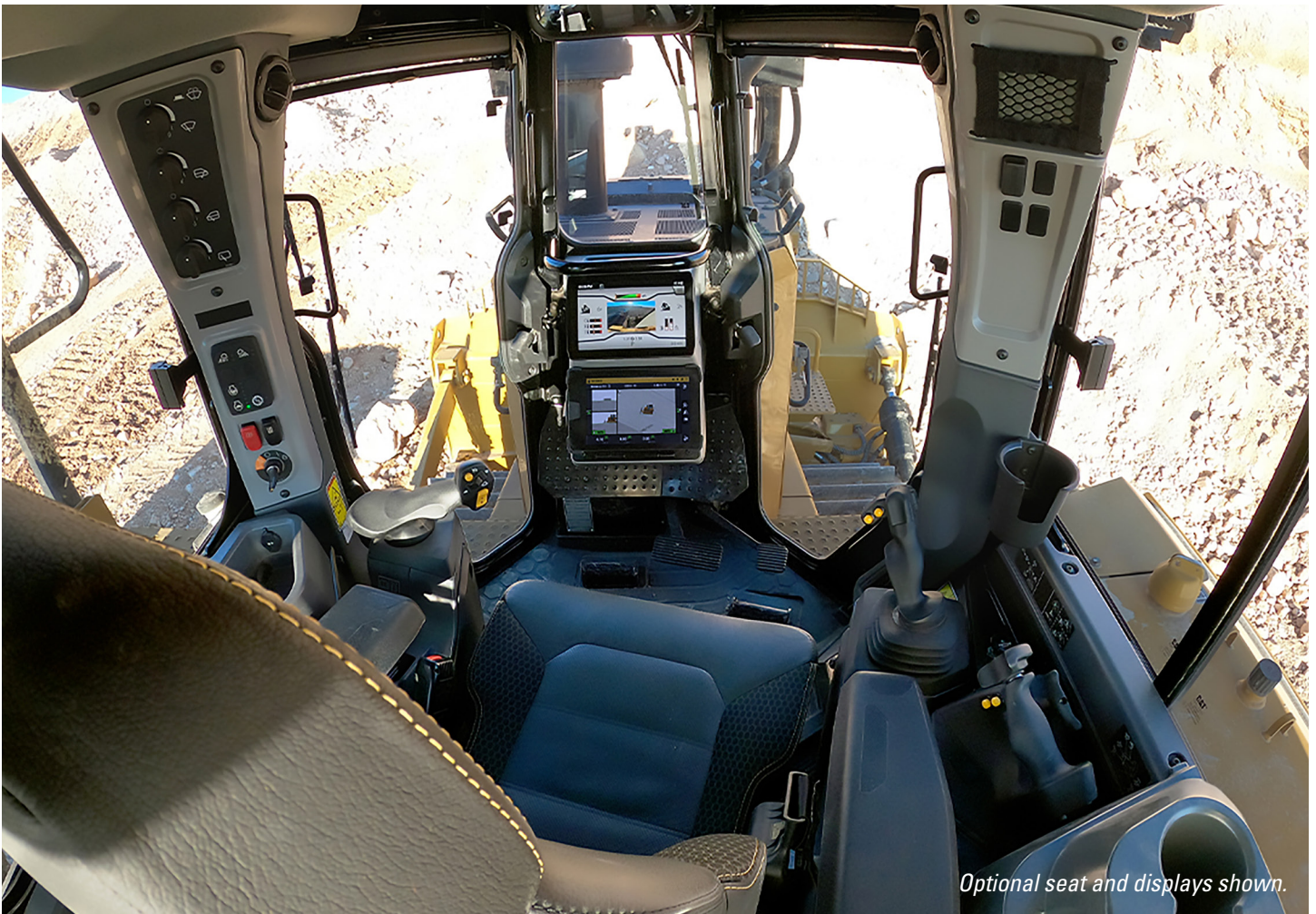
Optional seat and displays shown.

Step into a spacious cab that resets the industry standard for operator comfort, visibility and ease of operation. Integrated Rollover Protective Structure (ROPS) leaves plenty of glass area for all-around visibility. Clean sight lines along the hood give you an excellent view to the blade.