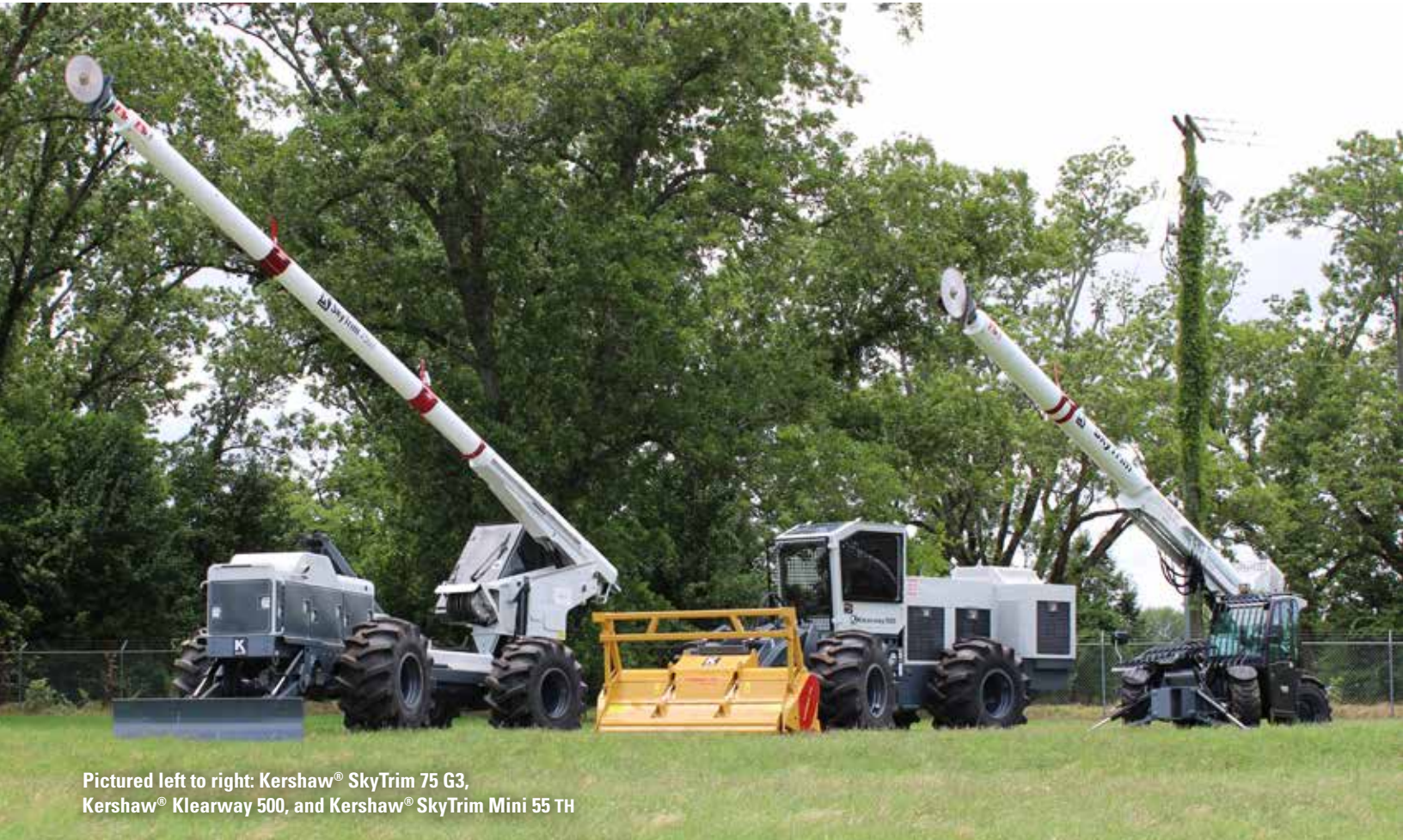
Pictured left to right: Kershaw® SkyTrim 75 G3, Kershaw® Klearway 500, and Kershaw® SkyTrim Mini 55 TH