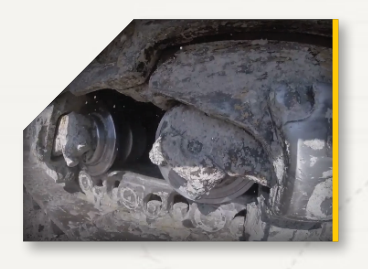
Cat® HDXL with Duralink™: 3,300 hours, 70% rail wear, .24" scalloping.