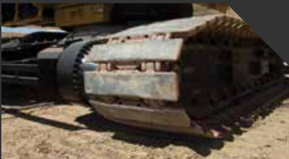
SHOVEL STYLE 7295-7495