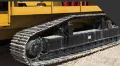
CONVENTIONAL ALL TRACK AND ROTARY