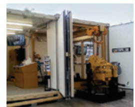
External view of workshop.