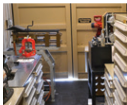
Self-contained hydraulic workshop.