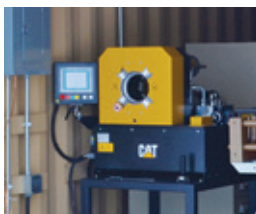
Crimp press inside a workshop.