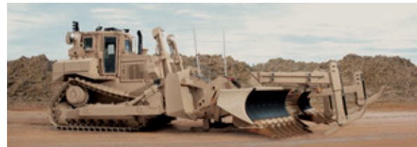
V-shaped Mine Plow