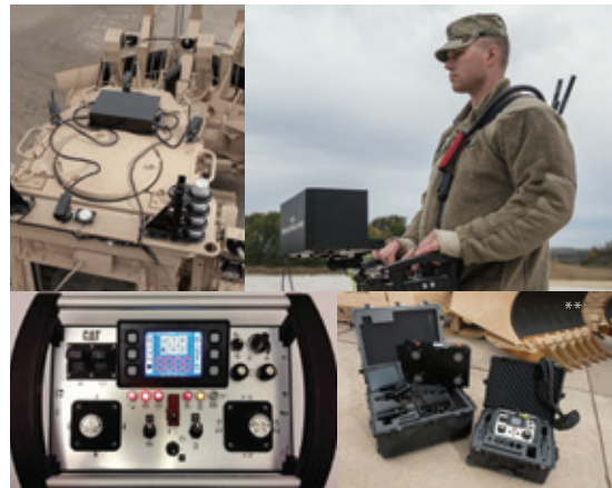
Vision System and Remote Control