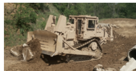
D7R-II with Machine Armor Protection