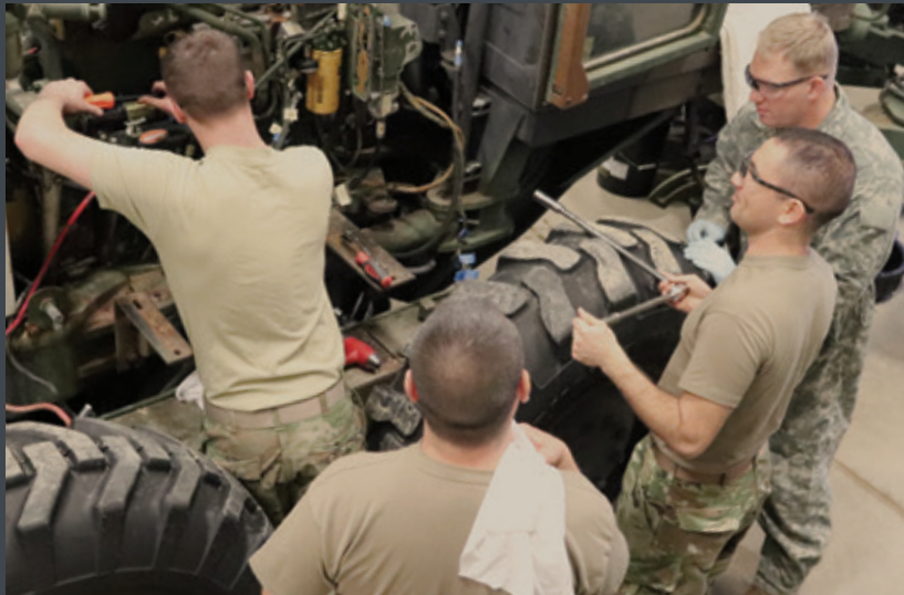
The appearance of U.S. Department of Defense (DoD) visual information does not imply or constitute DoD endorsement.

Get classroom and hands-on experience working with Cat engines and components from a team with over 90 years of experience training technicians in commercial and military applications. Standard training courses are offered at Caterpillar and customized courses can be held at your location to meet specific needs.