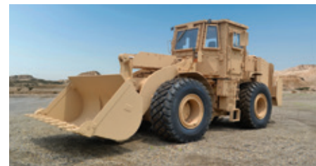
966H with Crew Protection Kit

Machine Armor Protection (MAP) is available for critical machine automotive components.