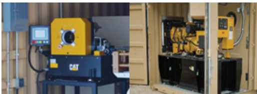
Mobile Hose Shop